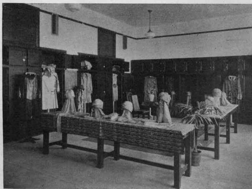
Textile and Clothing Veishea Exhibit

It is the desire of the foods and nutrition faculty to show their guests one