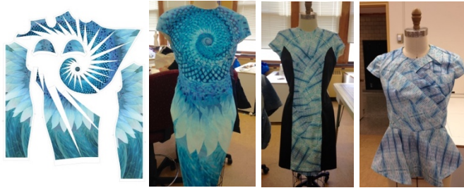
Figure 2. Digitized engineered print and three finished garments

parallel. Next the image was copied and reflected both horizontally and vertically to create the repeating stripe with mirrored tints and shades. The color was altered through a series of filters, and the hues and saturation were altered until a striking motif was produced. It was printed out on cotton twill and cotton sateen and then cut in the shape of the pattern. The sunflower print started with an image of the center of a sunflower, a separate image of sunflower petals, and an artistic depiction of the Fibonacci sequence with other “golden spirals” spinning off of it. The three images were layered together with varying opacities in order to create a striking visual representation of a naturally occurring eternal sequence. The patterning process for the garments were completed using flat pattern technique to create Fibonacci sequence. Lines for the dart placements were plotted as tangent lines from the spiral. The sunflower motif was “engineered” to fit directly onto the pattern pieces in Illustrator, so that the sunflower motif would match up once the 29 darts were sewn.