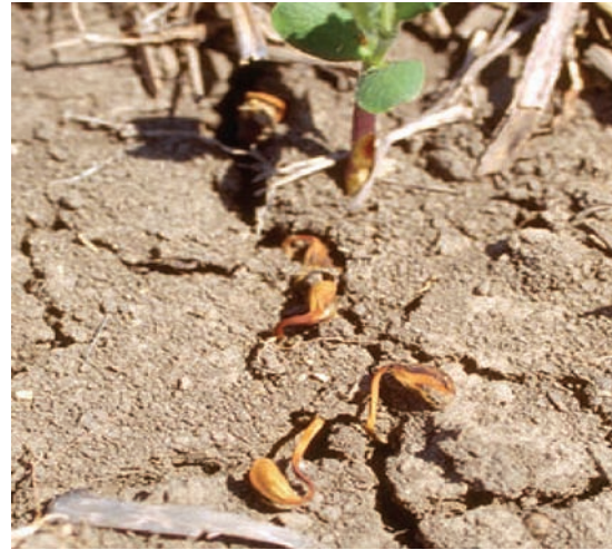
Postemergence damping off caused by Phytophthora . (X. B. Yang)

The fungicide seed treatments Apron XL ® and Apron Maxx ® previously have been shown to have significant results when Phytophthora disease pressure is high. A study done in Ohio in 2003 showed fungicide seed treatments increased grain yield by more than three times the cost of the treatment in four of five trials.