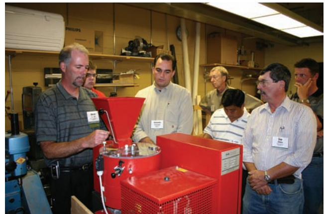
Participants learn to use a batch seed treater.

reserves the right to limit the number of persons attending per company or institution. If you have questions about registration, contact University Conference Services (UCS) at (515) 294-6222. To register online, go to www.ucs.iastate.edu . To register by fax, call (515) 294-6223. To register by mail, send registrations to University Conference Services, 102 Scheman Building, Iowa State University, Ames, IA 50011-1112.