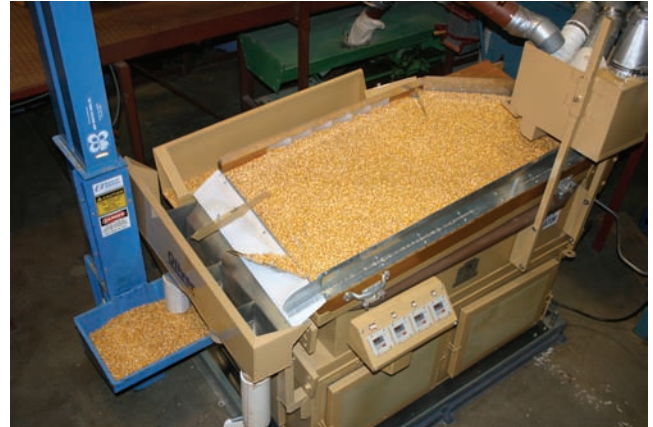
Gravity separator in operation.

The workshops will be held in the Seed Science Center at Iowa State University. Parking is available nearby. You'll receive a map and parking permit with your registration confirmation. Enrollment is limited in workshops. Registration will be accepted on a first-come, fees-paid basis. The coordinator of the workshops