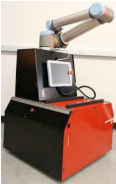
Fig. 2. The Enviratron Rover.

this, and only a brief overview of these features will be explained in this section.