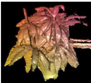
Fig. 5. A sample of fused image

The value of 140 conservatively thresholds out many extremely bright pixels, such as the walls of the growth chamber. Next, a 2 \times 2 rectangular structuring element was used to morphologically dilate the image (Jain, 1995), conservatively removing many noisy elements. This resulting thresholded and dilated depth image, which contains the plant pixels plus some other pixels, is passed to the KinectFusion algorithm with default settings except for expanded voxels in the camera's left-right direction, which it labels as X. The goal is to probe leaves close to the front of the plant, so Y and Z are currently not very important. Most settings were found to have minimal effect on the results. An example fusion image is shown in Fig. 5. Finally, the mesh is processed by the mesh probing algorithm.