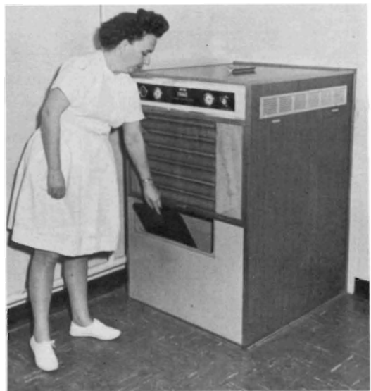
Mrs. Houser removing a developed radiograph from the Kodak X-omat automatic film processor.

The Section of Veterinary Obstetrics and Radiology within the department of Veterinary Clinical Sciences has greatly increased its efficiency in radiographic processing by the addition of a Kodak X-Omat automatic film processor. The processor has reduced the developing time of exposed radiographic film from over two hours to seven minutes. The processor can handle films ranging in size from 5 by 7 inches to 14 by 36 inches with the capacity to process 115 film sheets of intermixed sizes per hour or 17 inches per minute of continuous roll film. Developing, fixing, washing, and drying all take place in a continuous operation with a dry developed film the end result. The X-Omat provides service for emergency surgery, increased economy and processing capacity, and produces a product of uniform quality.