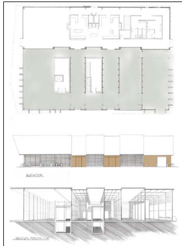
Figure 3. Proposal drawing by Sarah Sandor.

as well as the new local food farm neighborhood. Through an intense onsite survey of the existing Dutch barn at the north end of the site, Sarah Sandor developed a adaptive re-use strategy for the severely dilapidated assembly. Working with the dormant nature of the barn and landscape, Sandor was able to construct a programmatic sequence that would shore up the existing structure and community as a whole. This assembly is to accommodate seasonal exchange and preservation goods produced by the local farmers. Exchange would take place in the 'dormant' areas of the facility (see gray area on plan drawing in figure 3). Preservation would take place in the set of root cellars inserted below the 'dormant' area (see section in figure 3). Dissemination of knowledge regarding harvest, presentation and preservation would take place in the kitchen/seminar space along the western bay of the existing building. The proposal includes a new roof assembly with a series of incisions to provide additional daylight and cross ventilation in the 'dormant' area.