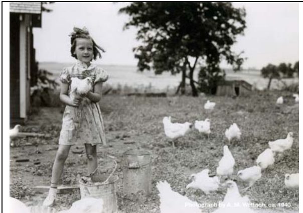
Figure 1. Image of Iowa by A. M. Wettach, ca. 1940.