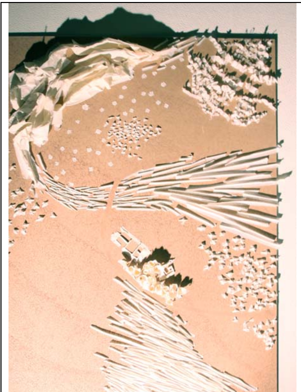
Figure 4. Site plan by Lauren Strang.

Strang's experience with the Bronnenbergs lead her to design, on multiple scales, a farm based on the evolutionary spatial efficiency of a honeybee colony referred to as the Apis mellifera : from the soil conditions influencing vegetation; the buildings arrangement on the site; the orientation and interior layout of the residence; down to the organization of the kitchen and its corresponding equipment. By allowing the activities occurring in the 'space between' to inform the constructed forms, an acknowledgment is made to the numerous small elements that ultimately defined a larger form and ultimately our comprehension specific to the development of honeybee colonies.