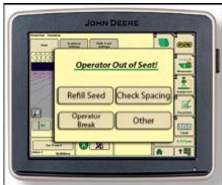
Figure 1: Theoretical view of the GPS monitor prompt