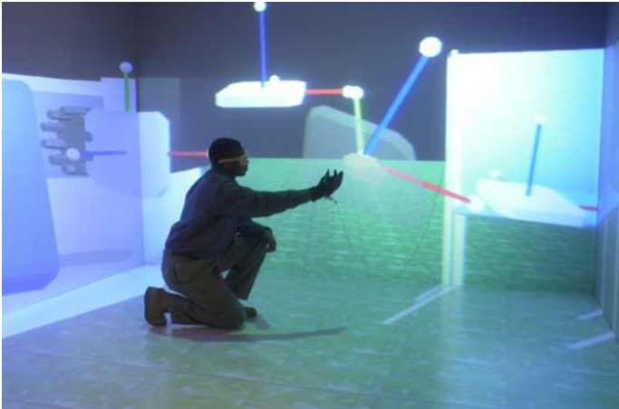
Figure 2. Placing locations in the VRSpatial application.