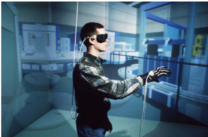
Figure 1. Virtual environment showing position-tracked visual and input devices.