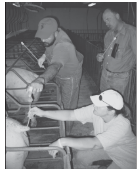
AI workshop, Research Alliance for Farrowing project.