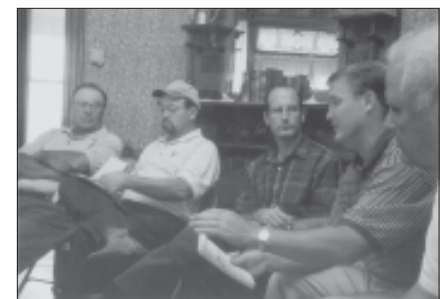
Vets’ Circle discussion before a field day.