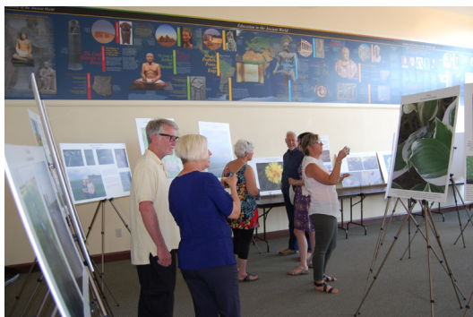
Exhibit viewers at the Perry Center showing.

“photostories,” have multiple benefits as a source of knowledge for participants and the community at large.