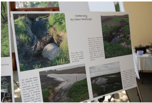
Photo display board.

At the second meeting, participants brought photos to share and told a bit about them. Facilitators asked, “What stories do these photos tell?” and “What stories are missing from these photos?” The group chose a new name for the project: River Stories: Views from a Watershed. This title was apt because two project participants were from the Des Moines River Watershed, and the group wanted to emphasize ties to both the Des Moines and Raccoon Rivers.