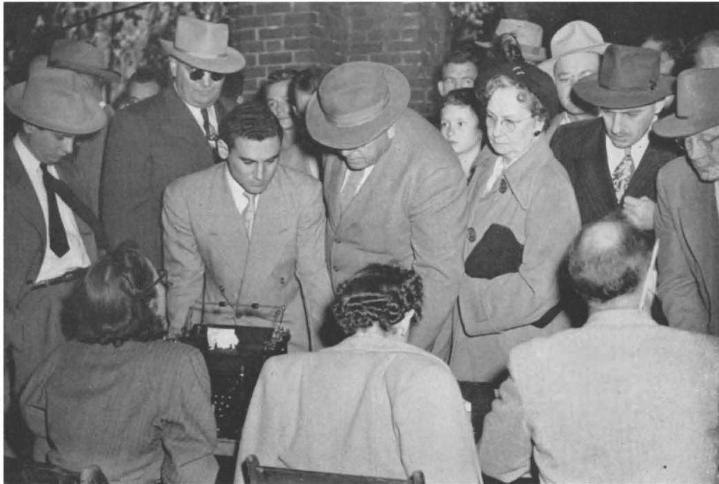
The registration desk at HOMECOMING .