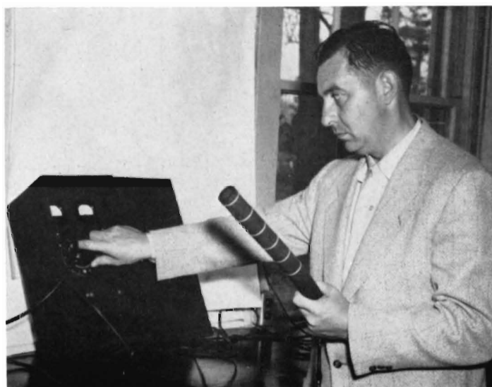
The Author Shown Holding Rectal Probe. The Right Hand is on the Voltage Control Knob.

prompted the development of a unit to collect semen by electrical stimulus. The instrument was designed by the Instrument Shop at Iowa State College.