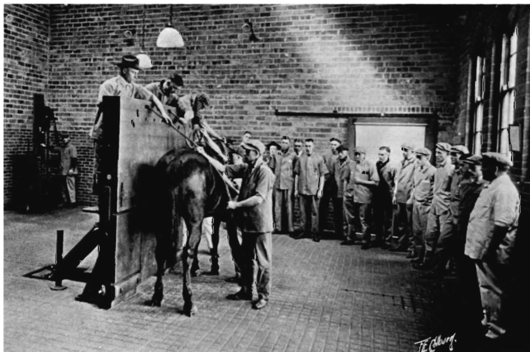
Equine surgery in earlier days.

The facilities of the veterinary college have changed dramatically since the early part of this century. The veterinary quadrangle, a landmark still visible on campus and just vacated by the veterinary school this past year, was completed in 1912 at a cost of $150,000. Since that time