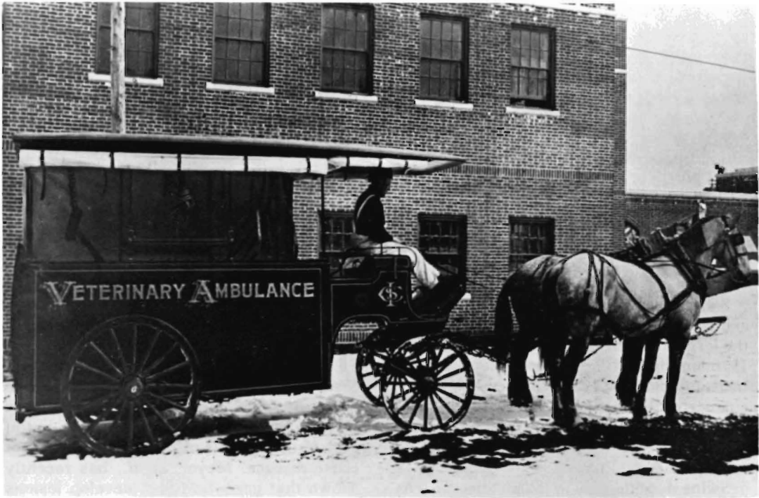
The ambulatory wagon next to the then-new veterinary clinic in about 1915.