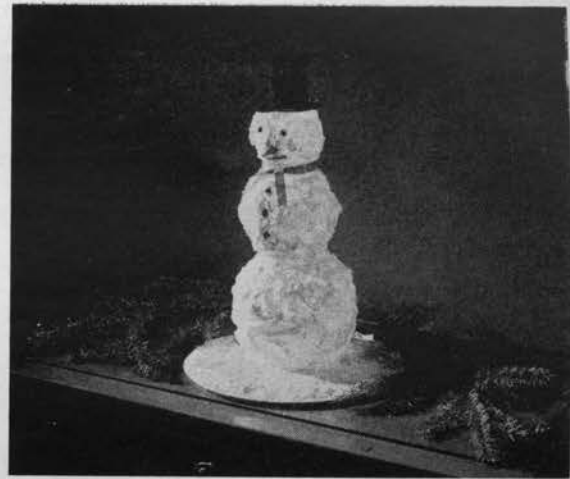
Above: A striking mantlepiece is an illuminated snowman made from glass rose bowls of graduated sizes. Light bulbs glow through the soap flakes suds snow.

Below: This table covering displays dolls of foreign lands. Inside the white tissue paper star which represents the star of peace shines an electric light bulb.