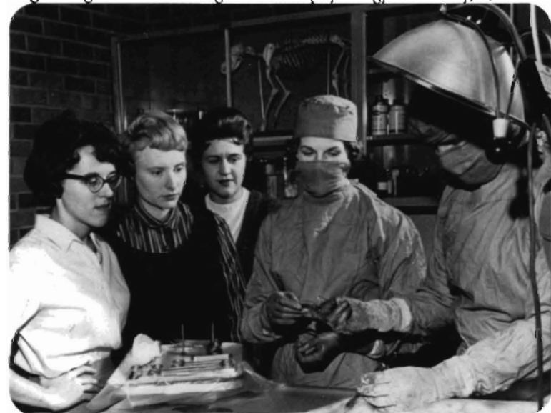
Above: When this photo was taken in 1962, the caption read, "Wives of future veterinarians learn more about their husbands' occupations, operating on a cat." Today a similar photo would probably read "Husbands of future veterinarians learn more about their wives' occupations." Among veterinary students, women currently outnumber men more than 2 to 1 at ISU.

BY ERIC VYMSLICKY.